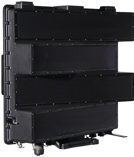
Lighter UV9-202 Mk 2 Radar (90° azimuth scan angle)